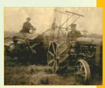
sie Gregg and Ge